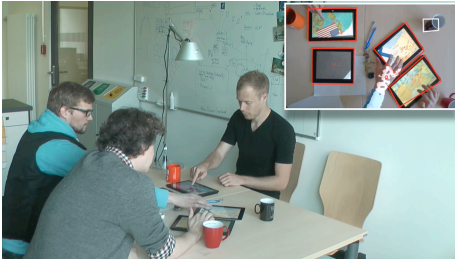
Figure 1. HuddleLamp supports a device ecology of heterogeneous form factors and display sizes for ad-hoc around-the-table collaboration.